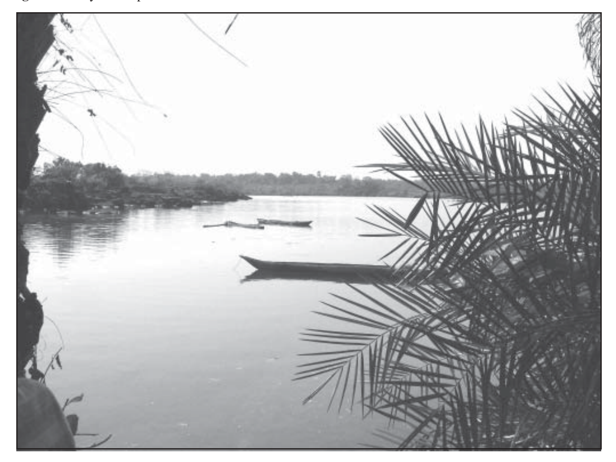
Figure 8: Sanya Pauli port.

whitewares, bottle glass as well as a gunflint. The presence of creamware and pearlware ceramics at Bangalan, and not at Farenya, clearly indicates that trading activities began earlier at Bangalan than at Farenya, or for that matter, Sanya Pauli. Stretching over 100 meters between the Lightbourn house and the port, a substantial paved masonry ramp and road is still present. Further inland from the Lightbourn house is a large area with imported glass and ceramics as well as considerable quantities of locally manufactured pottery. Additionally, a single blue bead was found during the reconnaissance. Although no structural remains are visible in this area, the nature of the archaeological materials suggests that this area is very likely the site of the contemporary village associated with the trading post.