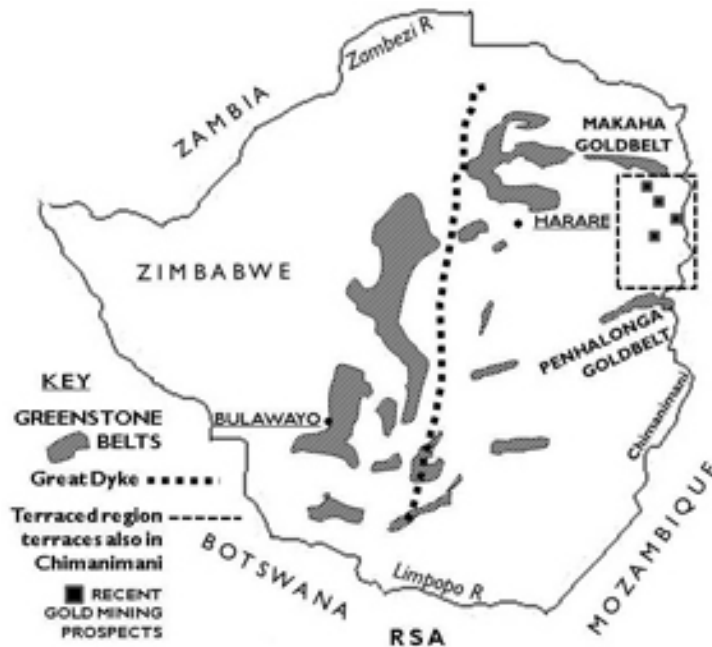
Figure 1: Map of Zimbabwe showing the auriferous greenstone belts of the central plateau. The rectangle represents the Nyanga terraced region predominantly granitic mountains of Manicaland, where Swan (1996:79) records no metal-milling sites. In contradiction, clan and place names tally with 20 gold-mining locations of historical Manyika (Kritzinger 2012b).

boulders and stones”] ... [were] for the purposes of cultivating corn,” reported in a letter to the national newspaper The Herald on 20 December 1898 that some of the “astonishing abundance” of terraces “owed their existence unmistakably to washing the ground for alluvial gold. Large quantities of quartz debris are everywhere observable and also old ground sluices.”