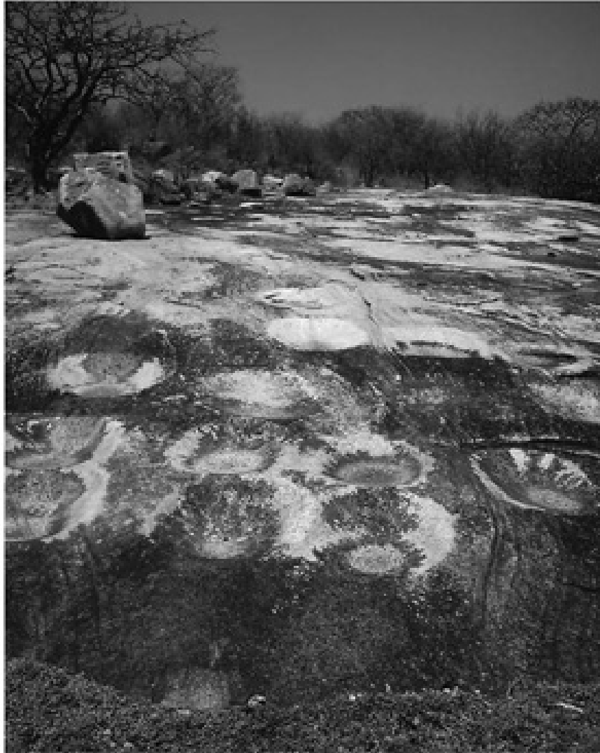
Figure 4: Large rock outcrop worn into hundreds of hollows by manual attrition. Gold values assayed in samples taken from three sections of the circumference (Table 1 i-iii). Catchments for rain water, these descending hollows are probably what Telford reported as “old ground sluices” in Zimbabwe’s national newspaper, 1898.

Three years prior to this new awareness Summers had published Plate 17a (1958) captioned “Grinding-holes in rocks”. A decade later he selects this illustration (1969: 176, incorrectly noted as page 17 ) as an example for distinguishing between “grain-grinding places on flat rocks” and milling sites for ore, attributing to the latter “the necessity of using permanent water for concentrating the gold”. In fact his Plate 17a example of grain grinding is on the lower slopes of Mt. Hamba, only about 200m from the headwaters of a tributary of one