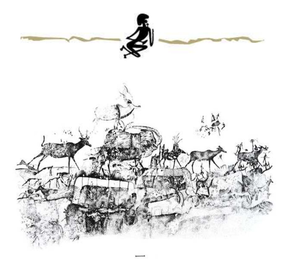
Figure 1. photo of Janet Duff's drawing of part of the main panel in Nswatugi Cave (as published in Parry 2000:104). The circled areas are shown in detail in the figures below.