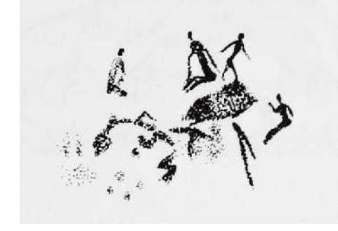
Figure 5. Detail from center right drawing of Nswatugi Cave (Figure 1)

Figure 4. A close-up of the right center area of the panel in Figure 2 enhanced using DStretch CRGB. Close-ups of several portions of this complex panel from Nswatugi Cave are necessary to see these figures. The arm of the figure on the right appears to reach up to touch the belly of the kudu cow. On the left, the figure has two arms, one bent back to touch his face. Might the gestures of these figures have important interpretive meaning?