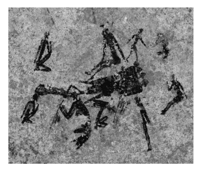
Figure 6. Same area of panel, photographed and enhanced using DStretch.

Figures 5 and 6 show a comparison between a precision drawing and an enhanced digital image of a small group of figures from the main panel at Nswatugi Cave. Many possibly important new details are revealed; the rectangular shape near the center of this group can now be seen as four connected humans, perhaps lying shoulder to shoulder or beneath a single blanket with their heads