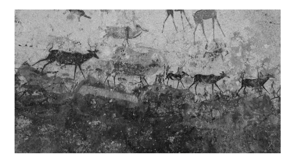
Figure 2. Stoll photo (3438Tif) of the same panel as in Figure 1 in Nswatugi Cave, DStretch CRGB enhanced, followed by Photoshop conversion with RED emphasized.