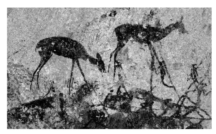
Figure 8. DStretch (RGB0) enhancement of the same area of the panel in Nswatugi as Figure 7. Several hidden figures appear beneath the right-hand duiker. Note also the fine lines above and between the animals.

Figure 7. Photo of Janet Duff's drawing of a portion of the panel in Nswatugi Cave depicting two duiker (published in Parry 2000, pg.26).