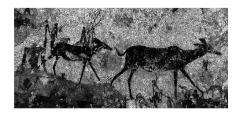
Figure 4. A close-up of the right center area of the panel in Figure 2 enhanced using DStretch CRGB. Close-ups of several portions of this complex panel from Nswatugi Cave are necessary to see these figures. The arm of the figure on the right appears to reach up to touch the belly of the kudu cow. On the left, the figure has two arms, one bent back to touch his face. Might the gestures of these figures have important interpretive meaning?

Figure 3. Stoll photo (3438Tif) of same panel in Nswatugi Cave, DStretch CRGB with YELLOW emphasis. The identical image as in Figure 2 is here shown with yellow pigment highlighted, revealing many new details. At least two yellow animals appear, a possible kudu cow with lowered head above the kudu bull on the left side, and a large four-legged composite animal on the right. Additionally, a hook shaped form composed of yellow dots (possibly bees or termites?) is revealed below the kudu bull, as the outline of the formling (center right) emerges (these and other details are strikingly visible in the colour version of this image).